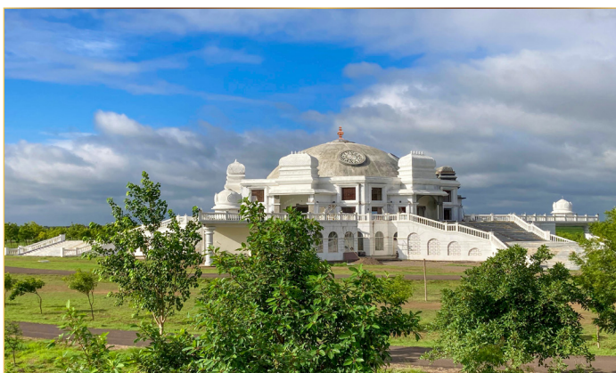
Sri Sathya Sai Premaniketanam, Vijayapura

Demonstrating their commitment to social responsibility and inclusive growth, Yaskawa India Pvt. Ltd. extended their support by sponsoring the education of students at the Sri Sathya Sai Premaniketanam campus in Vijayapura.