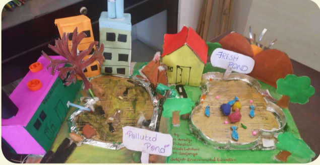
Field visits recreated through colourful models by students

Group projects are a common commission for getting a task done, working together promotes cooperation, shared responsibilities and most importantly collective learning and growing. Students of the Sri Sathya Sai Prashanthiniketanam, Siddipet campus went the extra mile while working on their environmental education project. During their holidays, they visited government hospitals, ration shops, a dam and upon their return, they put their heads together to come up with some inspiring models and charts that replicated what they had seen. They have made not only their teachers and peers, but everyone proud with their display of resourcefulness, creativity and teamwork.