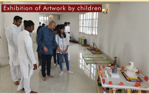
Exhibition of Artwork by children