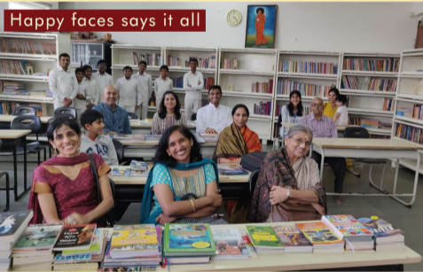
Happy faces says it all

A game of volleyball in the school grounds ended what was a perfect day for the visiting group.