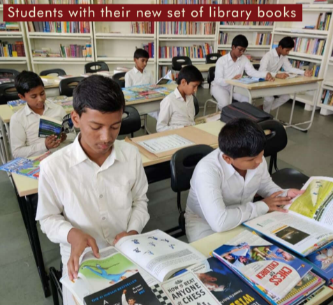
Students with their new set of library books

On December 21, a group of e1e1-ers visited the Sharada Niketanam boys' school in Mandya.