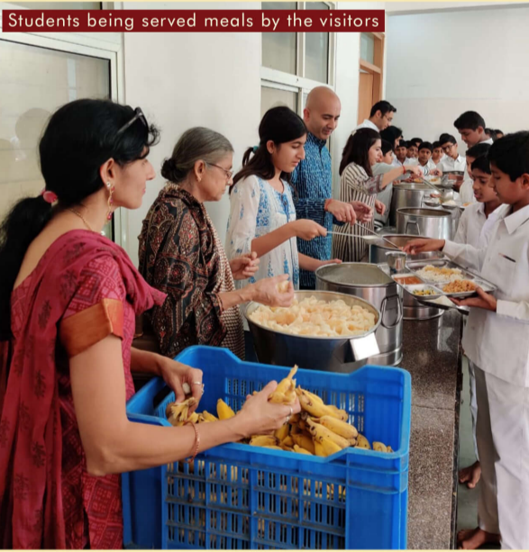
Students being served meals by the visitors