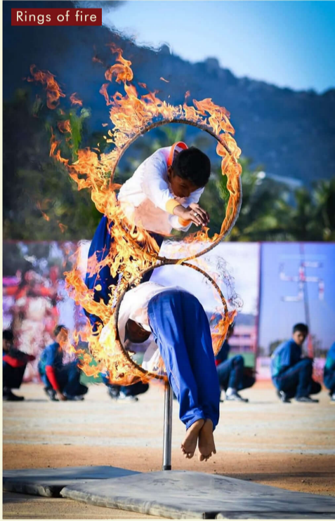
Rings of fire